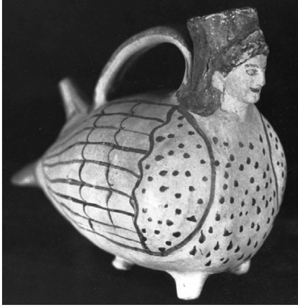
Figure 14: Terracotta scent bottle shaped as a Siren; made in Sicily, ca. 500 BCE.

Another Fury, Allecto, set people on fire. She was “infected with Gorgon’s venom” 73 and her