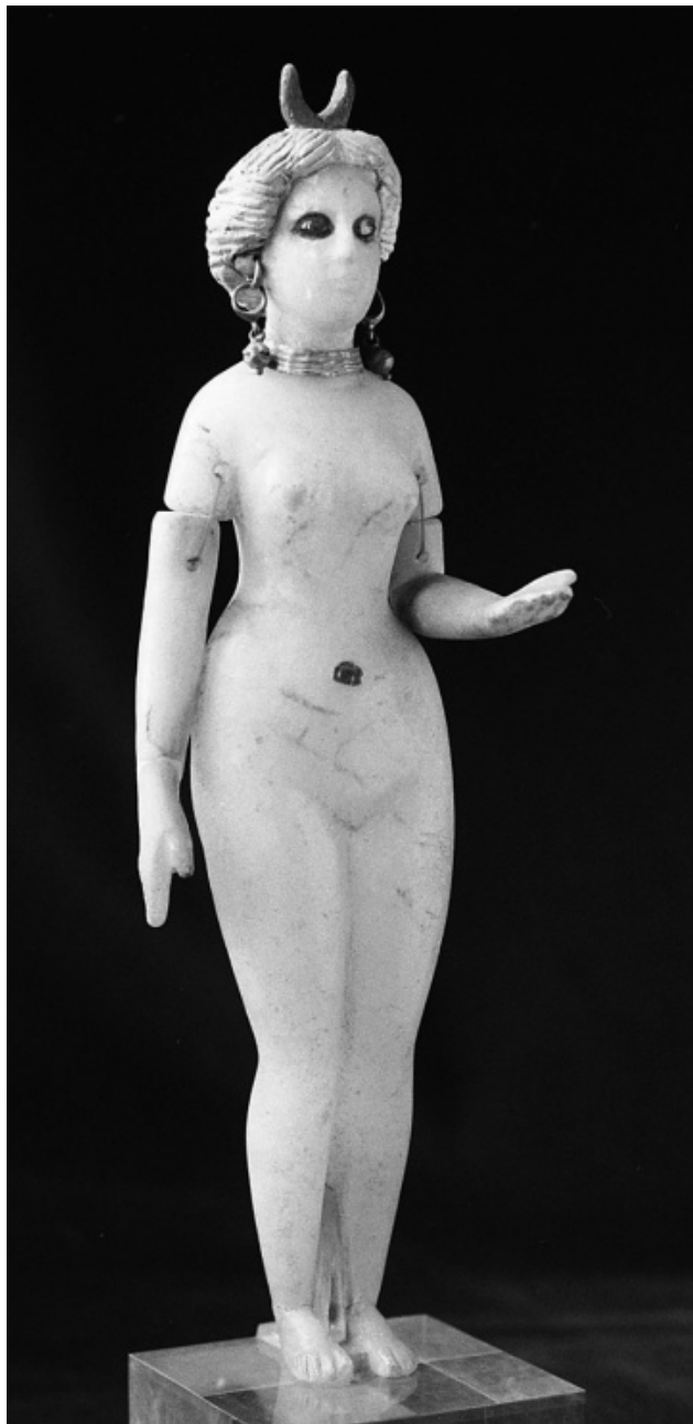
Figure 3: Inanna; gold, alabaster, and garnets, ca. 5th century BCE. Courtesy of Musée du Louvre, Paris (photo by Gregory L. Dexter).

down upon headless bodies. 30 The cuckoo, which represents the season of spring, can also represent death. In some Baltic folksongs, the cuckoo is an incarnation of the dead mother. 31