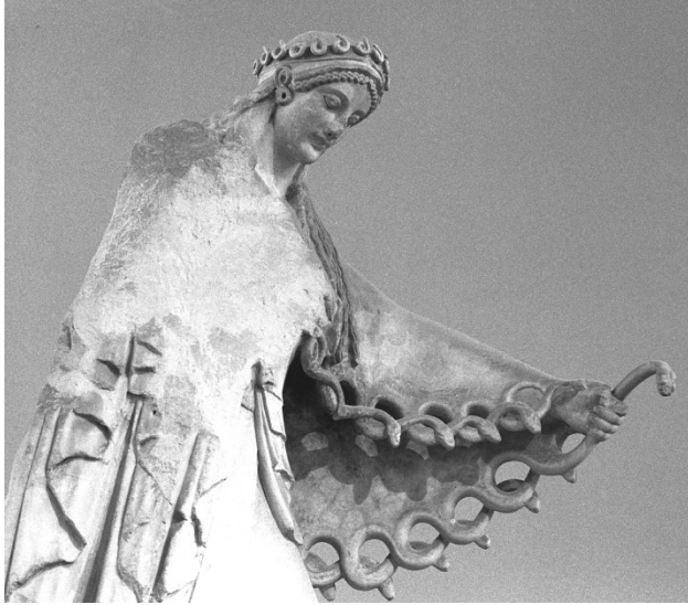
Figure 10: Athena from the pediment of the temple of the Peisistratidai, in the grouping from the Gigantomachy, ca. 520 BCE. Courtesy Acropolis Museum, Athens, Greece, no. 631 (photo by Gregory L. Dexter).

Athena was frequently represented with her special bird, the owl, in both figurative form (Figure 9) and on coins. On the latter, Athena occupied the obverse of the coins, while the owl occupied the reverse. 51 The owl, which is active at night, the time of darkness, again, represents the ‘dark’ or death-aspect of the regenerative goddess. We may compare Athena, with her owl, to the winged Anat, who, as we discussed, was a young martial goddess similar in many ways to Athena. Thus the “bird of death” was sometimes translated into a goddess who could bring death on the battlefield. To Athena and Anat we may also compare the Germanic Valkyries, who were often represented iconographically as birds. They received half of the dead on the battlefield.