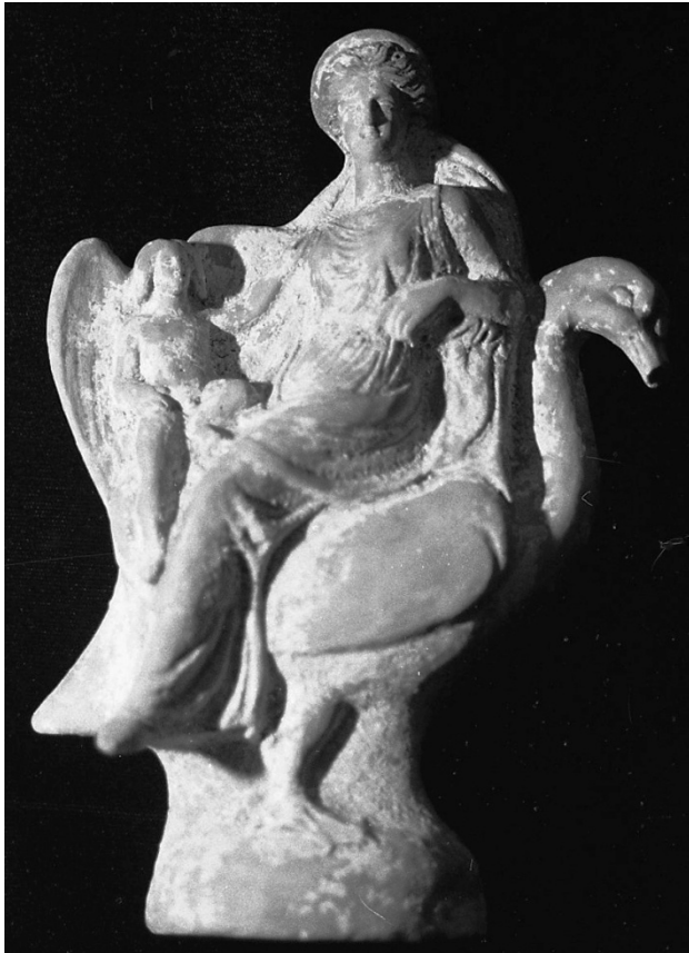
Figure 7: Aphrodite and Eros riding a swan or goose. Terracotta figurine, Tarentum, Italy, ca. 380 BCE. no. 1308.

represented as a bird of death; Isis was a goddess who both brought death and who protected the dead. Again, Isis is a goddess of both life and death, since she gives birth to Horus. 46 In fact, since Horus is conceived out of a phallus which Isis fashioned to replace the lost phallus of her dead husband, Osiris, Horus is reborn from Osiris. Isis is thus the goddess of life, death, and rebirth.