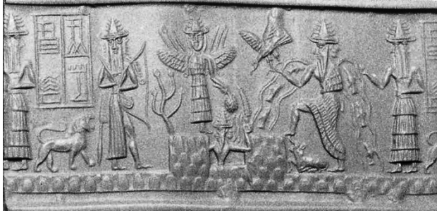
Figure 5: Cylinder seal impression showing Inanna with wings, ca. 2300 BCE.

Hebrew Lilith), was also depicted with wings. 40 Her Hebrew name means ‘a nocturnal spectre’, and it probably refers to the screech-owl. 41 In the iconography, Lilith has bird feet, probably owl or vulture-feet, 42 and she is accompanied by the owl; in reality, she is the owl as well. Lilith too was the bird of destruction, the bird of death. In the Sumerian poem, “The Huluppu Tree,” the Lil, the Anzu-bird, and a snake make their home in Inanna’s huluppu tree, and the goddess Inanna, who wishes to make a throne and a bed from the tree, laments that the three will not leave. Finally the hero Gilgamesh comes and smashes the snake, and the Anzu-bird and Lilith leave. 43 Thus, in Sumerian as well as Hebrew myth, the Lil, or Lilith, is monster rather than goddess.