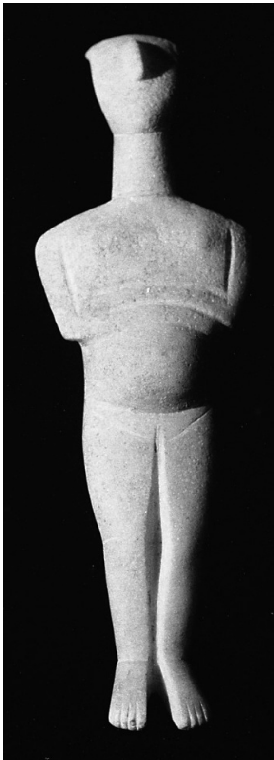
Figure 1: Marble pregnant figurine, Cycladic 2800-2300 BCE. British Museum no. GR 1932-10.181.