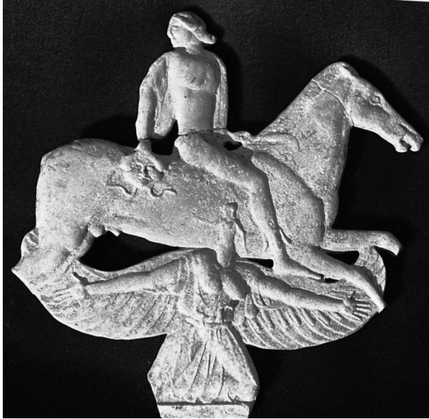
Figure 13: Perseus slaying Medusa. Melos, ca. 450 BCE

...Artemis stands, clothed in the skin of a deer, and carrying a quiver on her shoulders; in one of her hands she holds a torch, in the other two serpents. 66