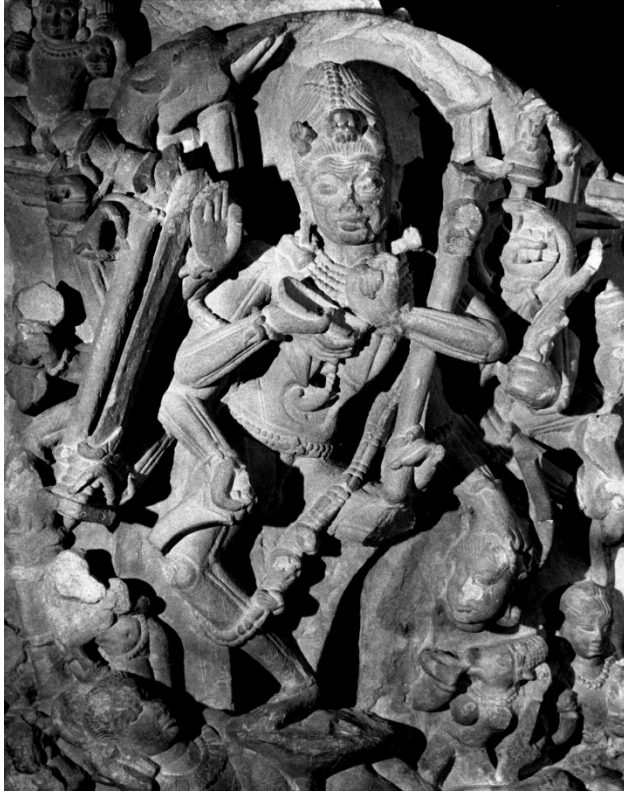
Figure 4: “Durgā Dancing.”