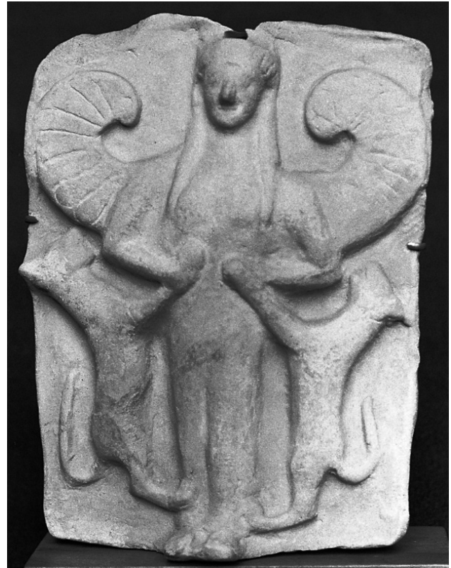
Figure 12: Winged Artemis with lions, Magna Graeca relief, ca. 550 BCE. Courtesy Musée du Louvre, Paris, no. CA 1810 (photo by Gregory L. Dexter).

Artemis was also responsible for human childbirth, as Artemis Eleithyia. The philosopher Plato describes her: