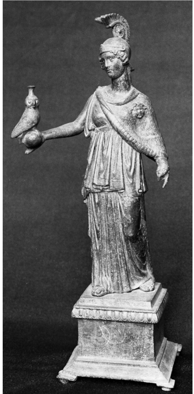
Figure 9: Bronze Athena, ca. 350 BCE. Courtesy of the Musée du Louvre, room 202, case III (photo by Gregory L. Dexter).

...bright-eyed Athena departed, having the appearance of a sea-eagle. . . 50