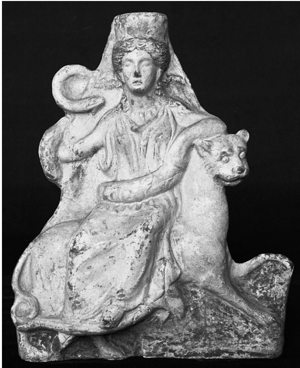
Figure 11: Terracotta relief of Demeter seated on a panther, with a snake around her shoulders, Thebes. ca. 350 BCE. Courtesy Musée du Louvre, no. CA 1447-9830743.

Another Greek goddess, Artemis , was in origin a mistress of animals, a huntress, at least, according to Classical authors. However, Artemis was not as removed from the unified Neolithic goddess as mythologists might claim: she was responsible for human, as well as animal, life and death. In Homer's Odyssey , Penelope, in her longing for her long-absent husband Odysseus, cried out to the goddess: