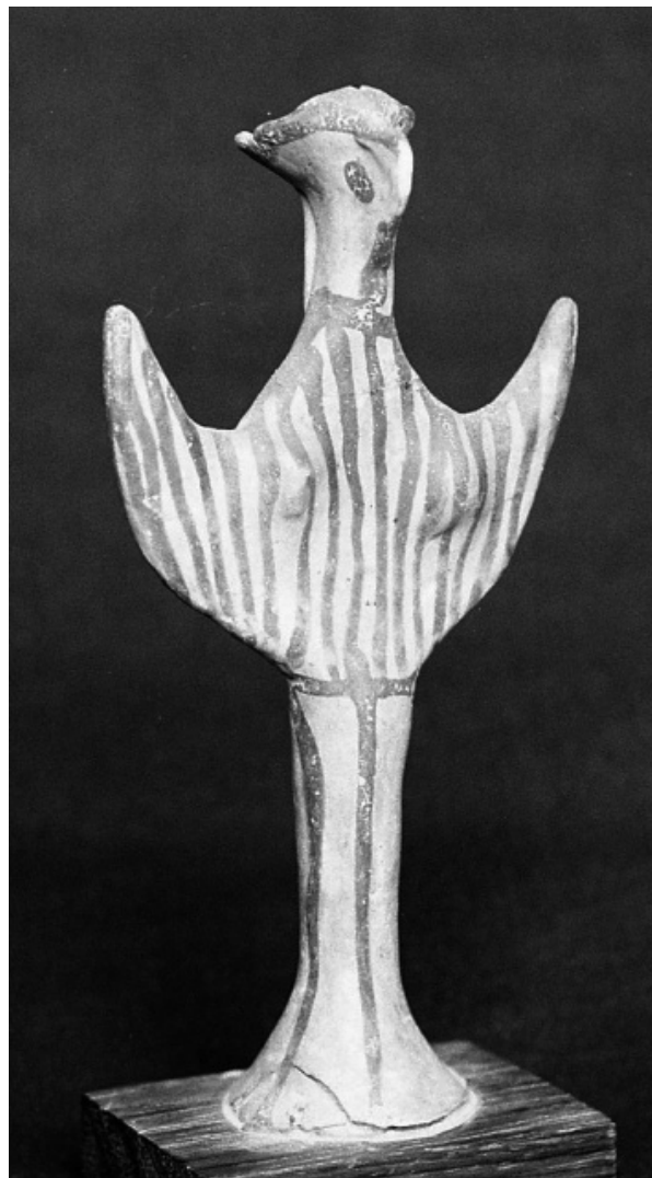
Figure 2: Bird goddess with stump arms from Tiryns, ca. 1200 BCE.

16 Ibid.: plate 28, capstone over end chamber of Cairn T (The Hag’s Chamber), Lough Crew, Ireland.