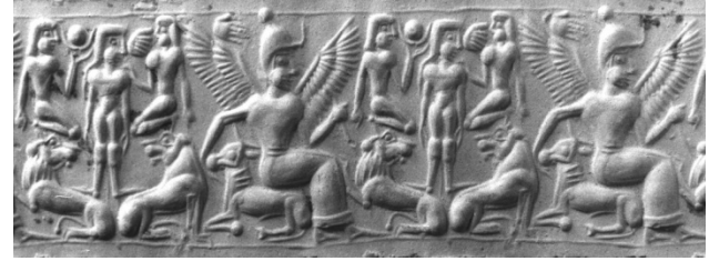
Figure 6: Cylinder seal impression depicting the winged Anat, Ras Shamra, Syria, ca. 1300 BCE. Courtesy Musée du Louvre, no. AO17.242 (photo by Gregory L. Dexter).

In The Book of the Dead (1550-1080 BCE), she tells the deceased: