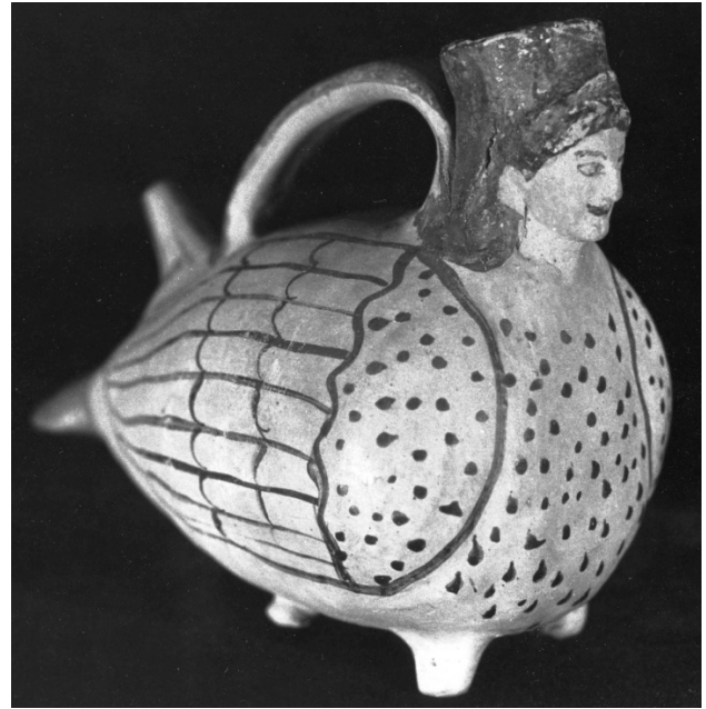
Figure 14: Terracotta scent bottle shaped as a Siren; made in Sicily, ca. 500 BCE. Courtesy British Museum no. 1846.5-12.14.

Irish bird-goddess who could bring death on the battlefield, as well as victory. Just as the Morrígan, Badb haunted battlefields, and she predicted death in battle. In the Táin , it is written, “ The Badb will shriek at the ford. . . ” 81 She prophesies death with a shriek; she is also called the “blood-red-mouthed,” personifying both the blood spilled in battle and the red of the Indo-European warrior-class. 82